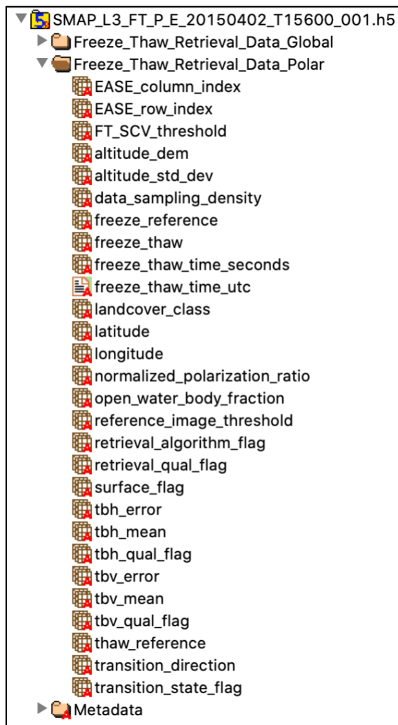
Figure 1. Subset of File Contents. For a complete list of file contents for the SMAP enhanced Level-3 radiometer freeze/thaw product, refer to the Appendix.