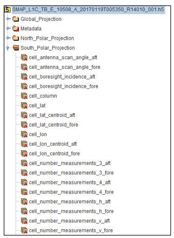
Figure 1. Subset of File Contents. For a complete list of file contents for the SMAP enhanced Level-1C brightness temperature product, refer to the Appendix.