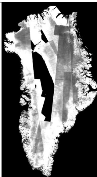
Figure 6. Sample ex.tif file for the dates 01 September 2019 to 30 November 2019.