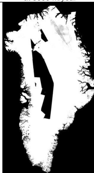
Figure 7. Sample ey.tif file for the dates 01 September 2019 to 30 November 2019.

Velocities are reported in meters per year. The vx and vy files contain component velocities in the x and y directions defined by the polar stereographic grid, EPSG 3413. These velocities are true