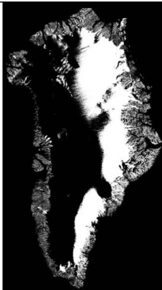
Figure 2. Sample vx.tif file for dates 01 September 2019 to 30 November 2019.