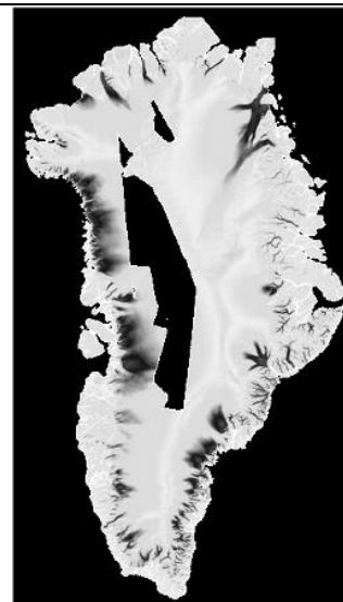
Figure 4. Sample vv.tif file for the dates 01 September 2019 to 30 November 2019; gray scale version of color log scale velocity saturating at 3000 m/year