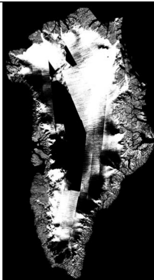
Figure 3. Sample vy.tif file for dates 01 September 2019 to 30 November 2019.