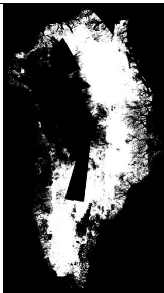
Figure 5. Sample dT.tif file for dates 01 September 2019 to 30 November 2019.