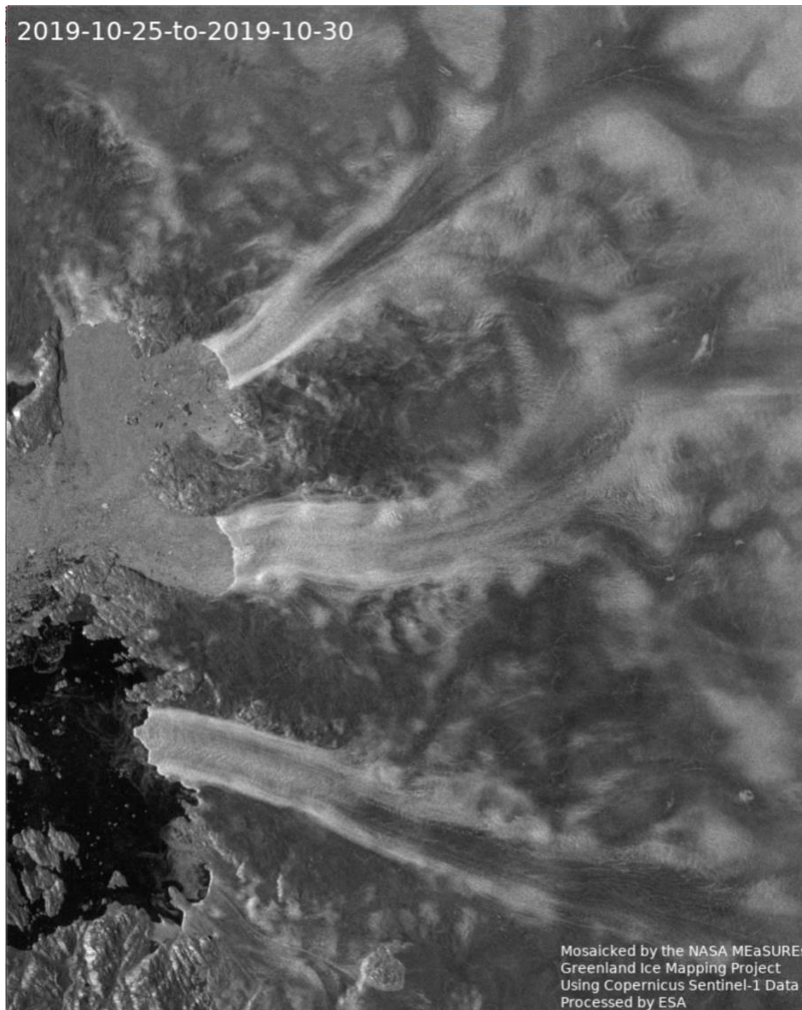
Figure 2. Individual frame from late October 2019 from the sample animation upernavik_v03.0.mov , focusing on the glacier termini near Upernavik in eastern Greenland.