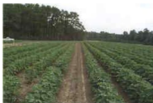
Figure 3. Cotton Crop in Georgia, USA

Vegetation conditions in the Georgia regional study area as expected in late June.