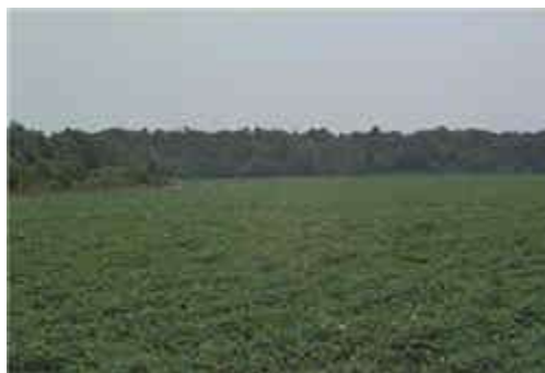
Figure 2. Peanut Crop in Georgia, USA

Vegetation conditions in the Georgia regional study area as expected in late June.