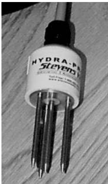
Figure 4. Stevens-Vitel Hydra Probe

Soil moisture and temperature were measured using Stevens-Vitel Type A Hydra Probes, as shown in Figure 4. This version is compatible with Campbell CR-10 data loggers; the temperature output voltage never exceeds 2.5 volts. The HP has three main structural components: a multiconductor cable, a probe head, and sensing tines. Precipitation was measured using Texas Electronics tipping bucket rain gauges.