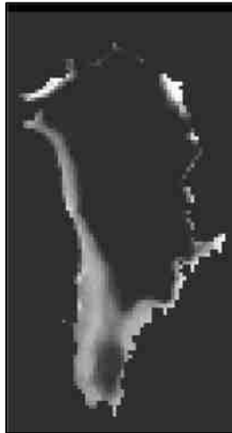
Figure 2. Sample image of an annual melt data GeoTIFF file.