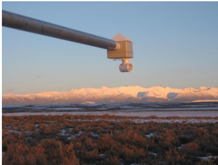
Figure 3. Snow Depth Sensor

Future investigators should use manufacturers' guidelines to calculate instrument error. No independent instrument calibration has been applied to these data.