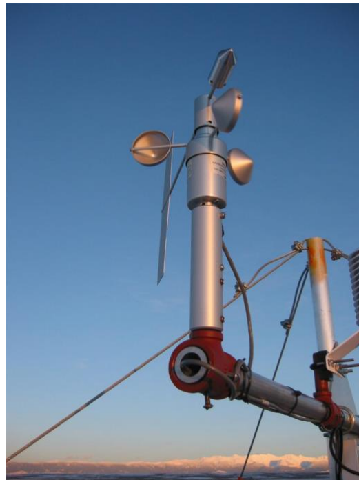
Figure 2. Wind Monitor

Below are photographs of the wind monitor (Figure 2) and snow depth sensor (Figure 3):