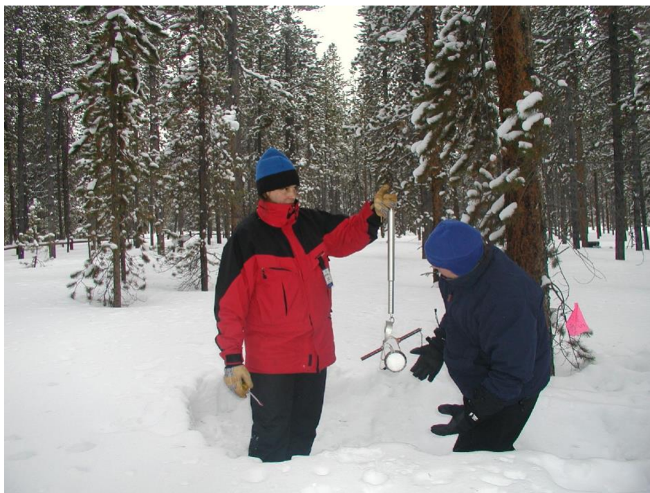
Figure 3. Scientists taking the SWE measurement

For complete information about data acquisition and processing, please see the CLPX Snow Pit Measurements document .