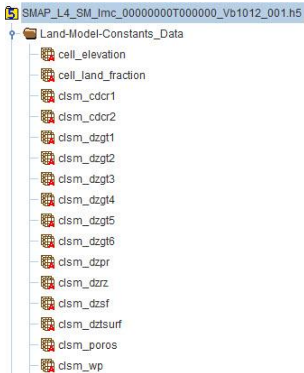
Figure 3. Subset of the Land Model Constants File Contents. For a complete list of file contents for the SMAP Level-4 soil moisture product, refer to the Product Specification Document .