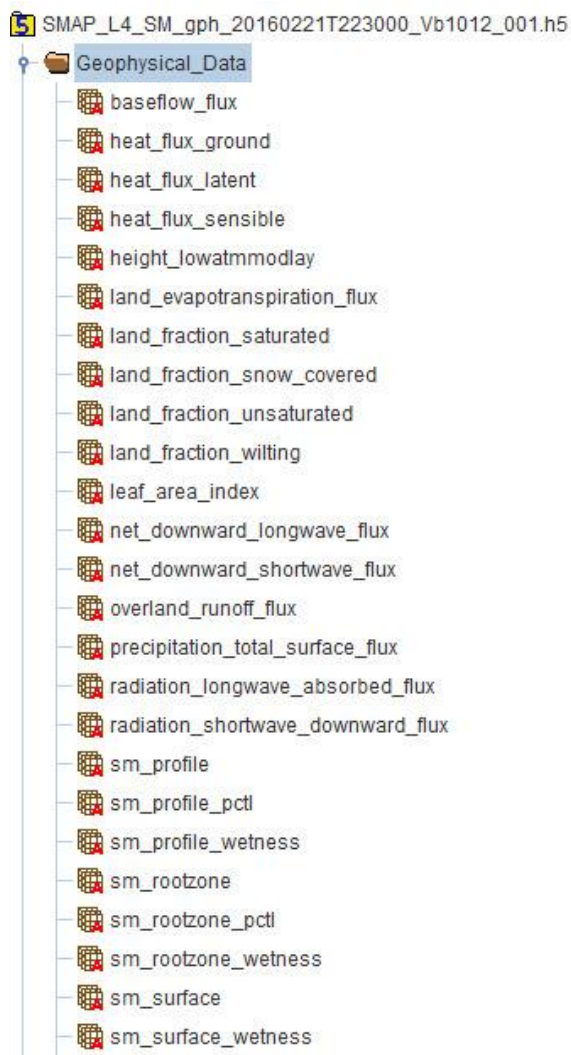
Figure 1. Subset of the Geophysical Data File Contents. For a complete list of file contents for the SMAP Level-4 soil moisture product, refer to the Product Specification Document .