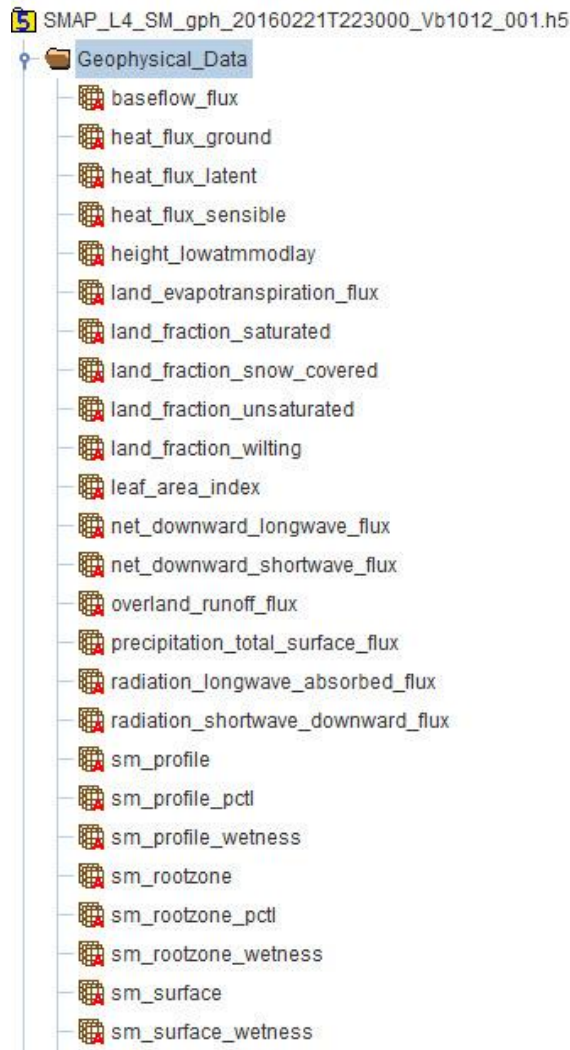
Figure 1. Subset of the Geophysical Data File Contents. For a complete list of file contents for the SMAP Level-4 soil moisture product, refer to the Product Specification Document .

The Geophysical Data (gph) product includes a series of 3-hourly time-averaged geophysical data fields from the assimilation system, such as surface and root zone soil moisture. Figure 1 shows a subset of the gph file contents.