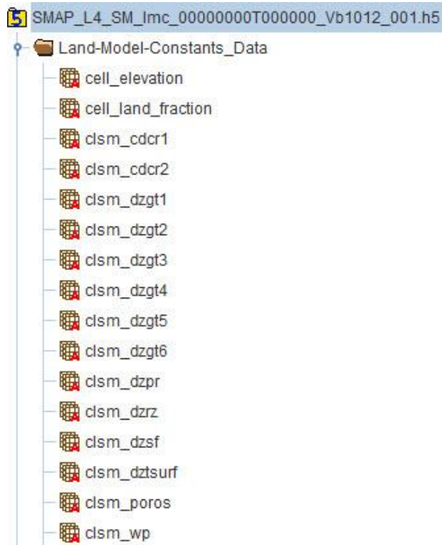
Figure 3. Subset of the Land Model Constants File Contents. For a complete list of file contents for the SMAP Level-4 soil moisture product, refer to the Product Specification Document .

The Land Model Constants (lmc) product includes static land surface model constants that provide further interpretation of the geophysical land surface fields. Figure 3 shows a subset of the lmc file contents.