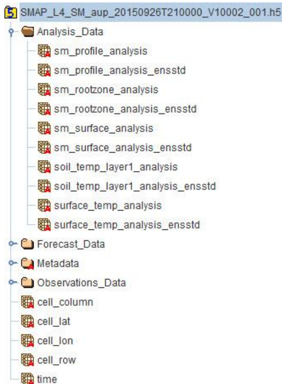
Figure 2. Subset of the Analysis Update Data File Contents. For a complete list of file contents for the SMAP Level-4 soil moisture product, refer to the Product Specification Document .

Figure 2 shows a subset of the aup file contents.