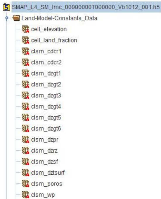
Figure 3. Subset of the Land Model Constants File Contents. For a complete list of file contents for the SMAP Level-4 soil moisture product, refer to the Product Specification Document .