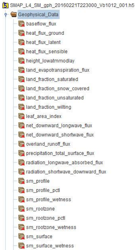
Figure 1. Subset of the Geophysical Data File Contents. For a complete list of file contents for the SMAP Level-4 soil moisture product, refer to the Product Specification Document .

The Geophysical Data (gph) product includes a series of 3-hourly time-averaged geophysical data fields from the assimilation system, such as surface and root zone soil moisture. Figure 1 shows a subset of the gph file contents.