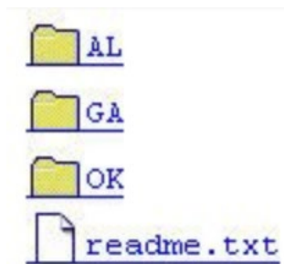
Figure 1. Directory Structure for SMEX03 ENVISAT ASAR Data

Data are available on the FTP site in the /soil_moisture/SMEX03/Alabama/satellite/ASAR/ directory. Located within the ASAR directory are three regional subdirectories (AL, GA, and OK) and the readme.txt file. Each regional subdirectory contains one INI file and one or more sets of JPG, JGW, ASCII text, and HAN files. Figure 1 shows the overall directory structure.