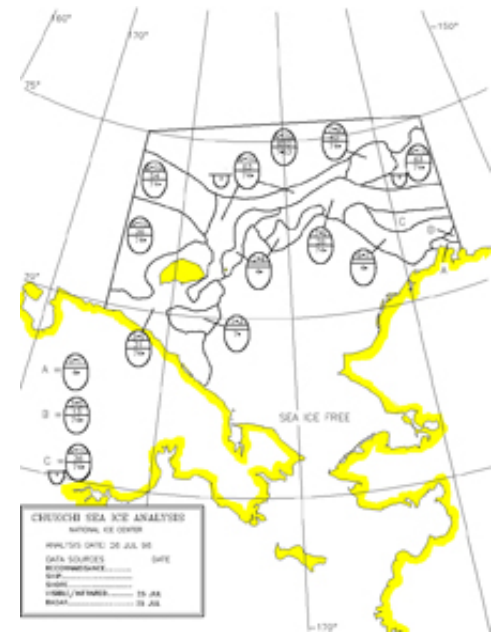
Example of one of the first digital ice analysis products produced by NIC. Click image for larger view.

A series of UNIX commands were necessary for the analyst to merge their lines showing the location of ice from the two different NIC analysis systems (including Terascan and the Navy Satellite Image Processing System). The ice lines and attributes were then pulled into GRASS where they were checked. Once the product went through the quality-control process, a digital graphics product could be generated. The ability to produce a digital product was a major advance for NIC, as this eliminated the need for paper products and the time-consuming process of hand-tracing analysis lines.