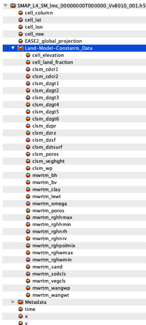
Figure 3. Contents of a Land Model Constants Data file. For a complete list of file contents for the SMAP Level-4 soil moisture product refer to the L4_SM Product Specification Document (Reichle et al., 2022).

All global data fields have dimensions of 1624 rows and 3856 columns (6,262,144 pixels per array).